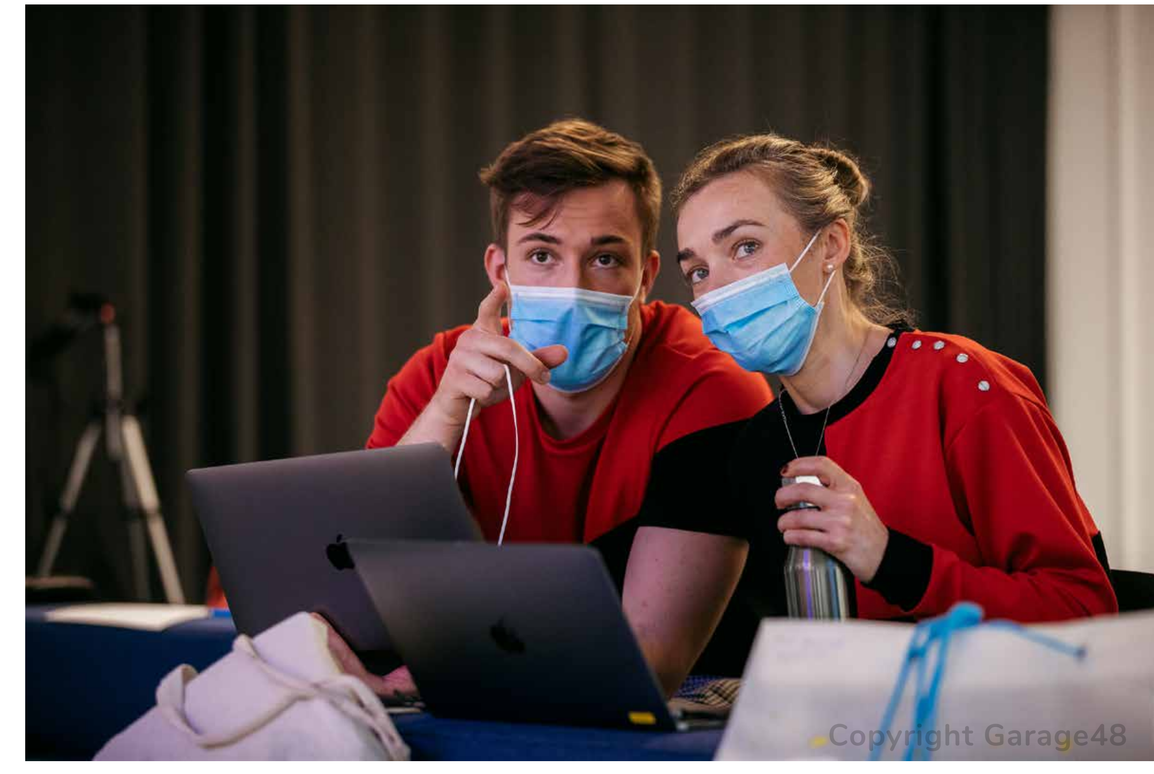
Garage 48 team members wearing our Tencel products

Since there is no Planet B, we have chosen to produce most of our B2B products from Tencel™ - a certified biodegradable fabric that is manufactured right here in Estonia. How cool is that!